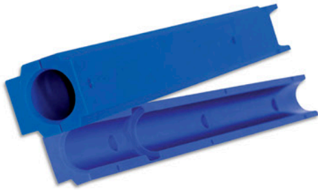
IEMCA loader Guide Channel