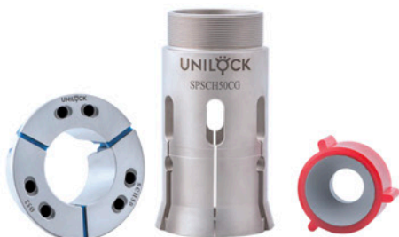
SP COMPATIBLE Clamping collects for multi spindle lathes