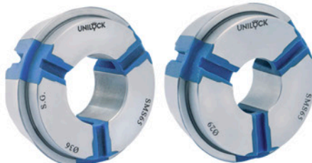
SMS COMPATIBLE Stationary force clamping system