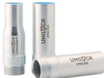
FEED FINGERS For multi spindle lathes