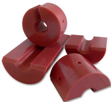
LNS LOADER Guide channel