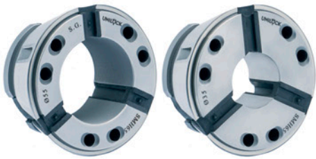
SMH COMPATIBLE Pulling force clamping system