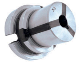
SME Expansion clamping system