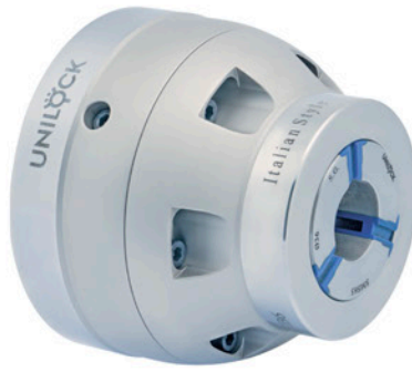
SMS COMPATIBLE Dead-length collect system