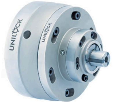
SME Expansion system