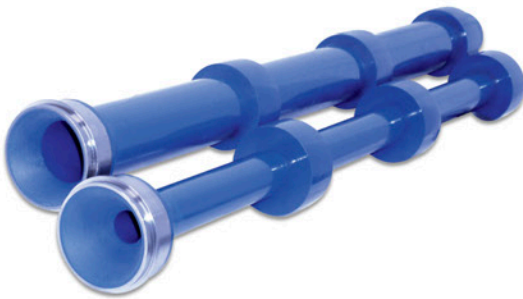
SPINDLE LINERS Vibration dampening