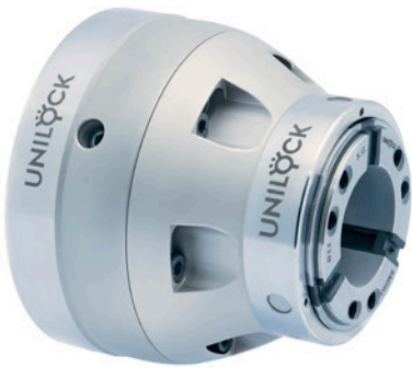
SMH COMPATIBLE Pulling force system