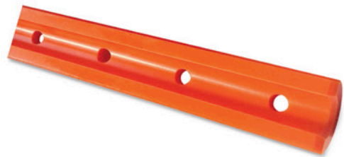
INDEX LOADER Guide channel