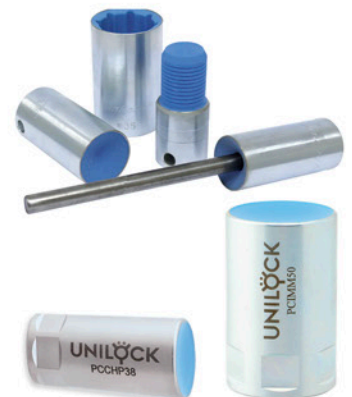
BAR LOADER Collets

HIGH CLAMPING FORCE, FLEXIBILITY AND PRECISION.